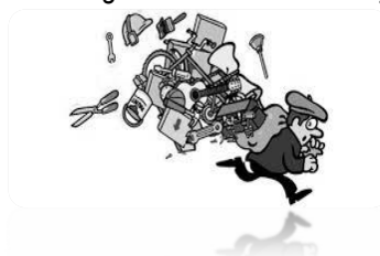
Fig.: Theft of Assets*